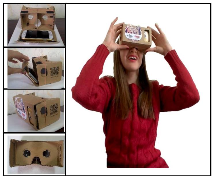
Figure 4. Medium VR: Google Cardboard and its usage in practice

Google Expeditions is a very good example put into practice for VR application in IBL process because enable teachers to bring students on virtual field trips to places like museums, underwater, and outer space. Expeditions are collections of linked VR content and supporting materials that can be used alongside existing curriculum. These trips are collections of virtual reality panoramas — 360° panoramas and 3D images — annotated with details, points of interest, and questions that make them easy to integrate into curriculum already used in schools. Google is working with a number of partners to create custom educational content that spans the universe.