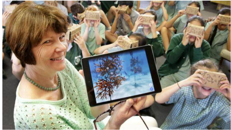
Figure 5. Google Expeditions in class [10]

Expeditions are group experiences (Figure 5) with a guide leading (teacher) and the explorers (students) following along. Google recommend a tablet for the guide and phones with Cardboard, a virtual reality viewer (Figure 4), for the explorers [9].